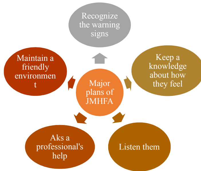
Fig. 2. Depicts the teaching of juvenile MHFA