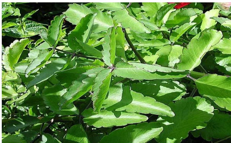
Fig. 1. A photograph showing the leaves and stem of Bryophyllum pinnatum plant

Adult Albino rat of both sexes (120-180 g) used in this study was acquired from the Animal house, Department of Pharmacy, Obafemi Awolowo University, Ile-Ife, Osun state, Nigeria. All the animals were housed in a clean and well-ventilated plastic cage under temperature 23 \pm 1^\circ\text{C} ; photoperiod (the interval in a 24 h period during which an organism is exposed to light), 12 h natural light and 12 h dark; humidity: 45 to 50%. They were also allowed free access to Balanced Trusty Chunks (Sai Durga Foods Ltd, Bangalore) and tap water. The cleaning of the cages was done daily. The rats were allowed to acclimatize for two weeks before the commencement of the experiments.