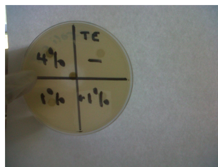
Fig. 4. Antimicrobial property of O. sanctum hexane