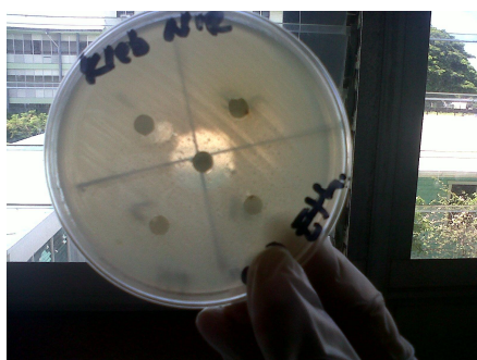
Fig. 2. Antimicrobial property of O. sanctum ethanol