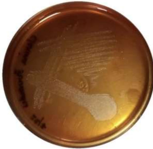
Fig. 1. Growth of Streptococcus suis on blood agar