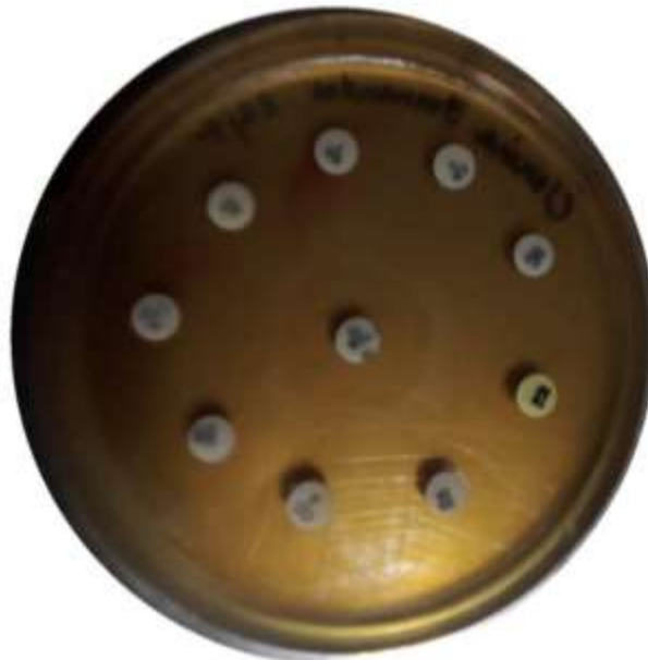
Fig. 2. Sensitivity plate