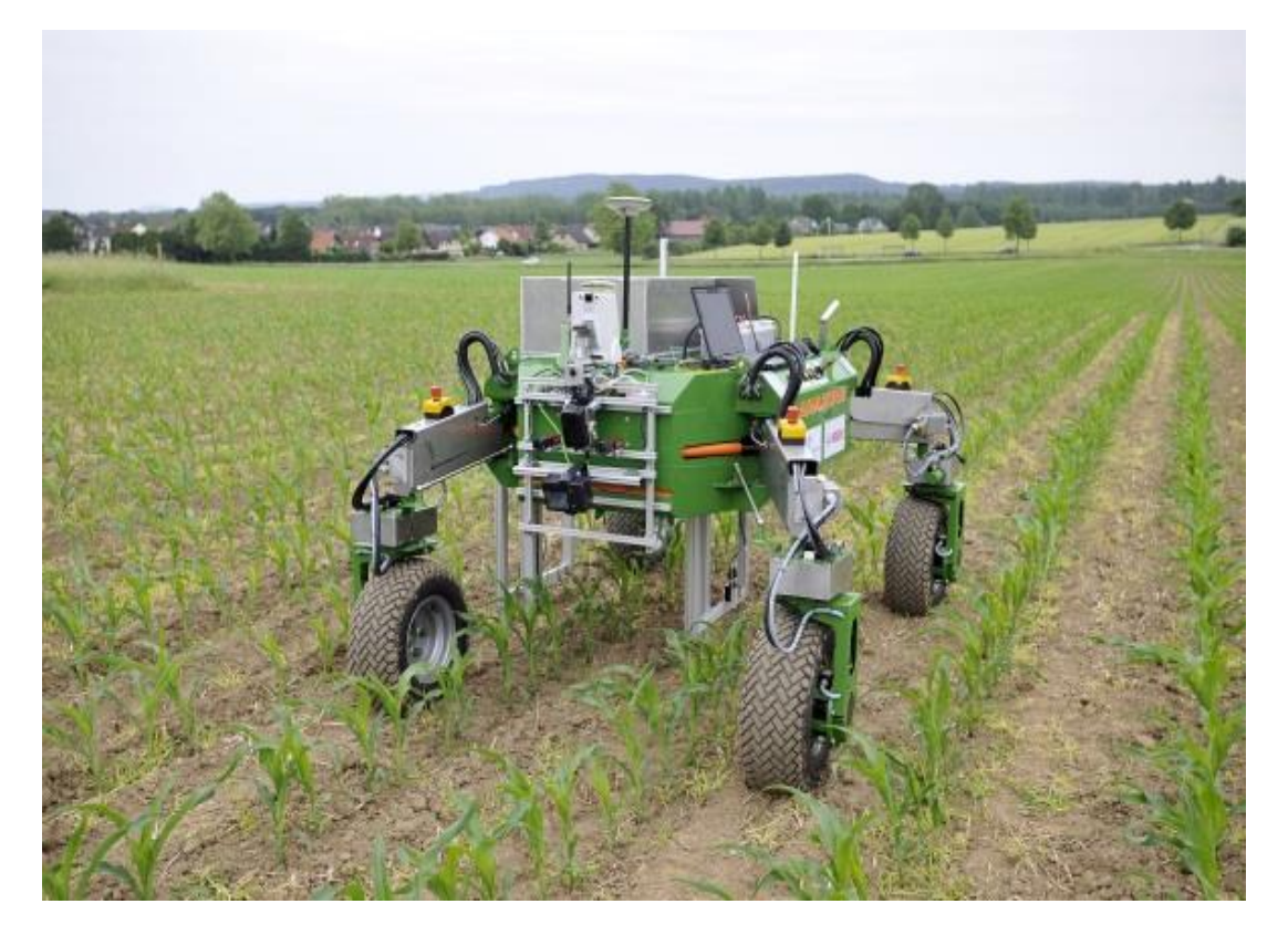
Fig. 3. Agriculture robotics and automation

Agricultural robotics and automation seek to improve productivity and reduce reliance on human labor. PA technologies provide essential navigation, perception, and decision-making capabilities to enable increasing autonomous operation. Current categories of agricultural robots and automation include: