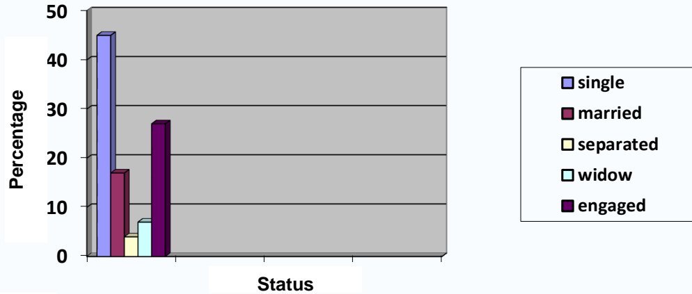
Figure 2. Marital status of the respondents.