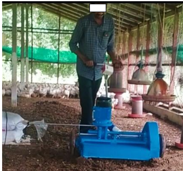
Fig. 2. Raking of litter using poultry litter raking machine

Similarly, the height of the wheel to the floor was also adjusted to have uniform coverage depth. The prototype machine thus designed was tested in the poultry farm of the innovator for three years (12 growing cycles). After every year, necessary modifications were made to the design to arrive at the final prototype.