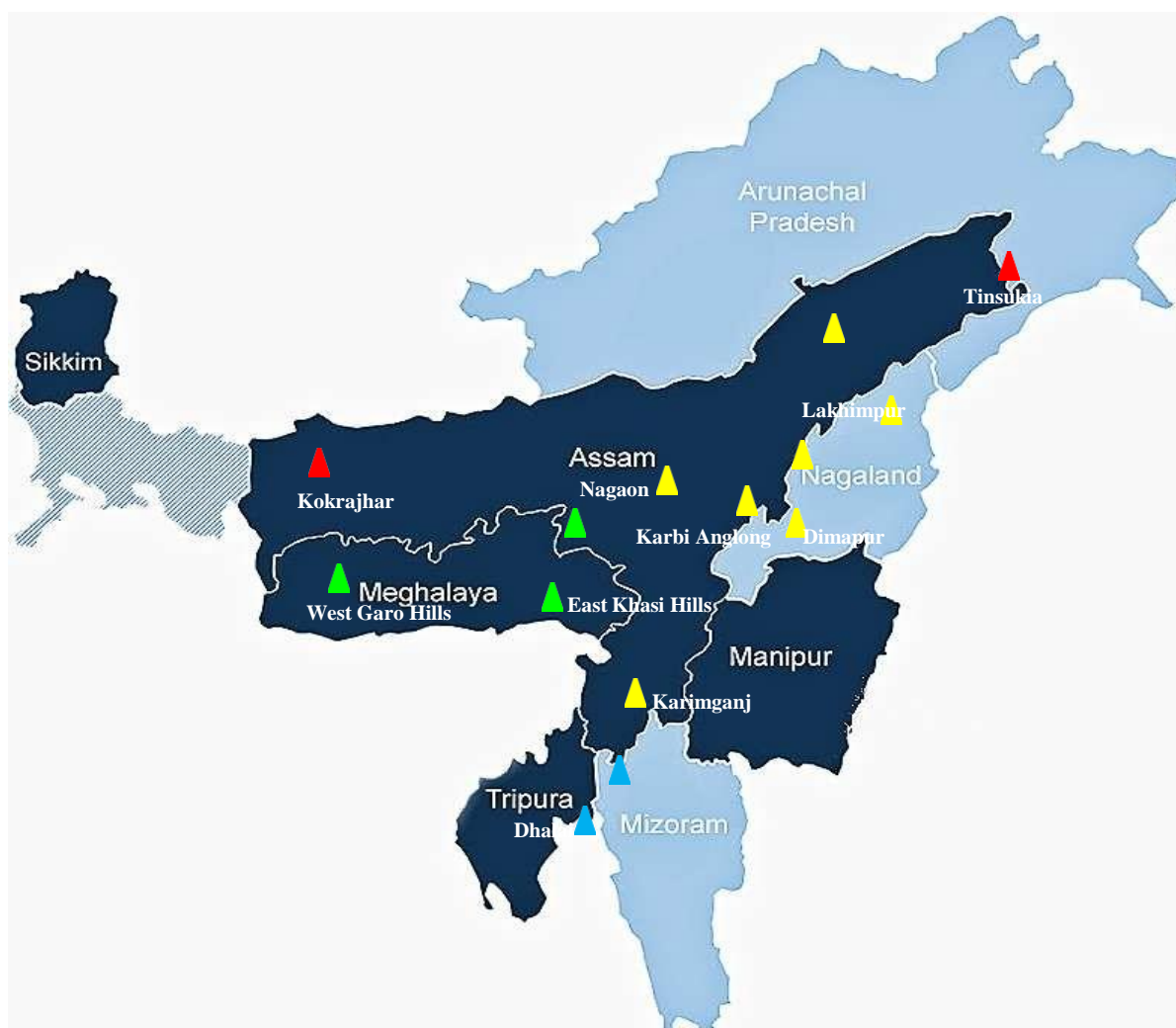
Fig. 2. Main districts (state-wise) engaged in pepper production