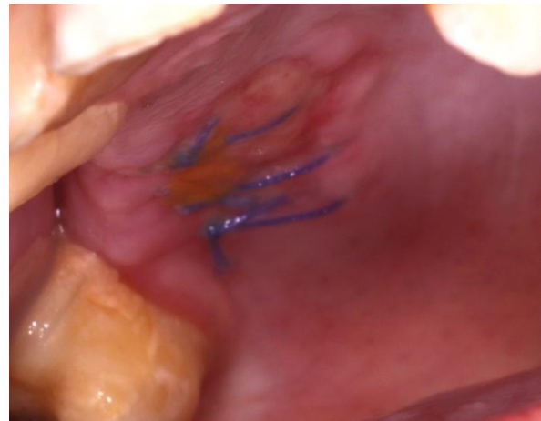
Fig. 10. Palatal site healing after 1 week