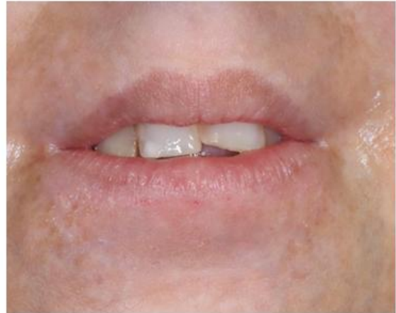
Fig. 2. Oral examination revealing microstomia