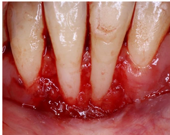
Fig. 6. Flap preparation with horizontal incisions and a de-epithelialization apically