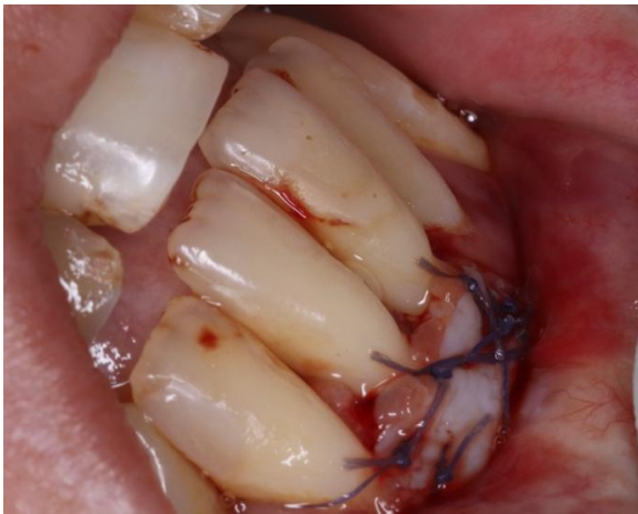
Fig. 9. Lateral view of the sutured FG