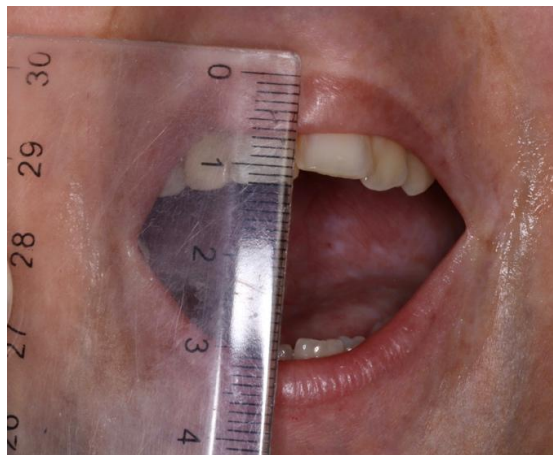
Fig. 4. Limited mouth opening of 35 mm