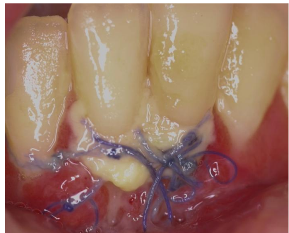
Fig. 12. Graft site healing after 2 weeks