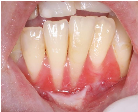
Fig. 5. RT2 recessions on teeth #42, 41 and 31