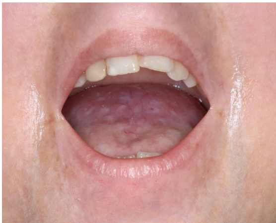
Fig. 3. Mouth opening revealing microstomia