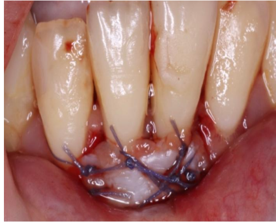
Fig. 8. Frontal view of the sutured FG