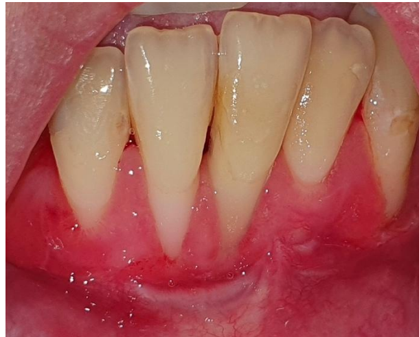
Fig. 13. Healing after 12 weeks

The patient was prescribed analgesics in case of pain and a chlorhexidine digluconate solution 0.12% mouthwash for 14 days. The patient was seen at 1, 2, 4, 6 and 12 weeks. Suture removal was completed after 6 weeks of healing to allow adequate connective tissue maturation and stability, especially in a scleroderma case, and a supragingival scaling with ultrasound was performed to control the plaque accumulation.