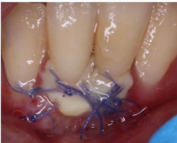
Fig. 11. Graft site healing after 1 week