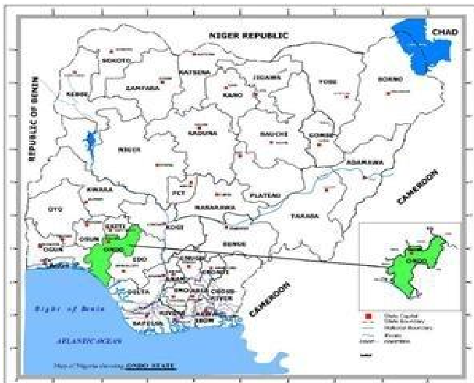
Fig. 2a. Map of Nigeria Showing Ondo State. Fig. 2b. Administrative Map of Ondo State Showing Owo LGA [25]