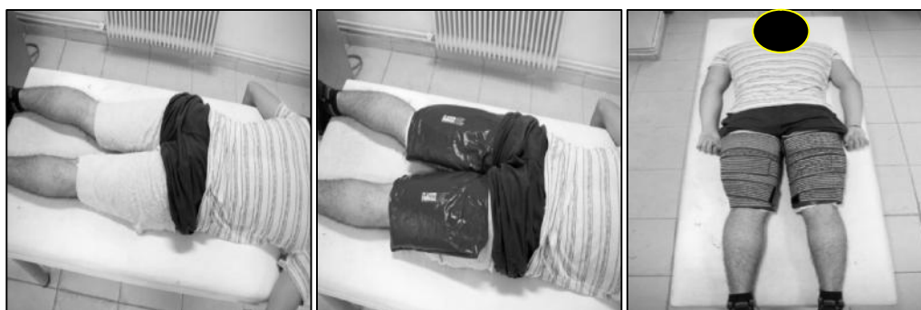
Fig. 2. The three consecutively stages until completion the cooling application