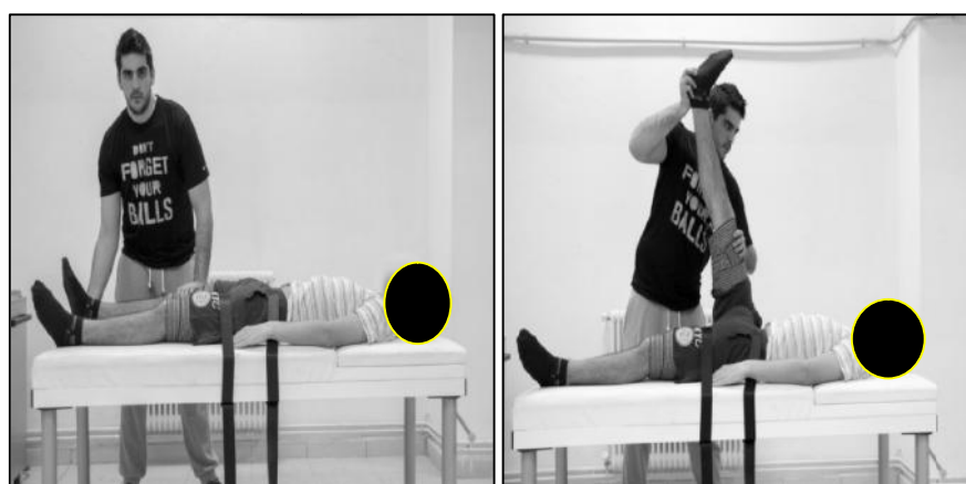
Fig. 3. The initial and final position of stretching procedure in Cryostretching condition