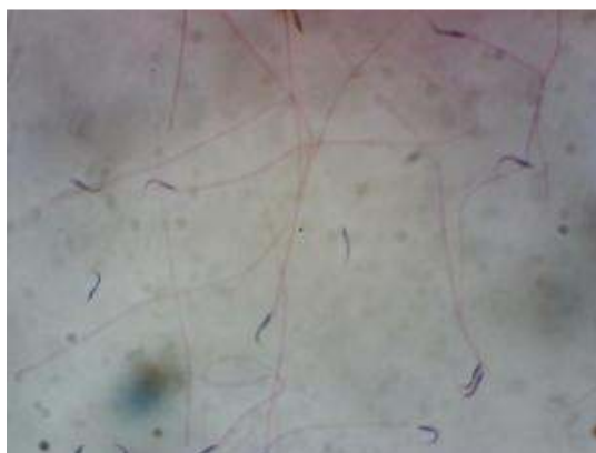
Plate 4. Photomicrograph of H & E Stained 3750 mg/kg dose rat semen showing normal sperm morphology (Mag. x 100)