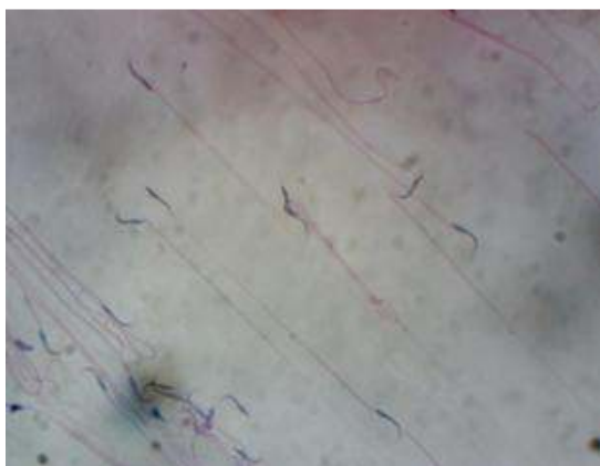
Plate 2. Photomicrograph of H & E Stained 1250 mg/kg dose rat semen showing normal sperm morphology (Mag. x 100)