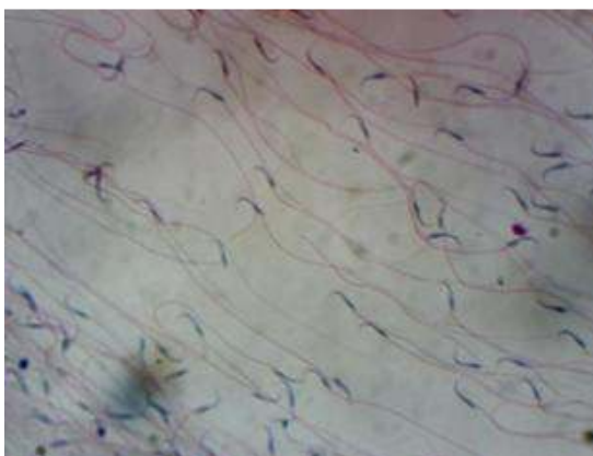
Plate 1. Photomicrograph of H & E Stained control rat semen showing normal sperm morphology (Mag. x 100)