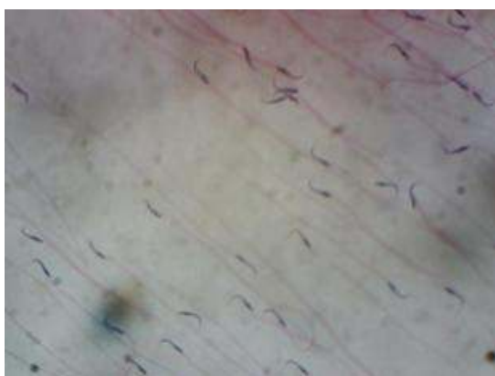
Plate 3. Photomicrograph of H & E Stained 2500 mg/kg dose rat semen showing normal sperm morphology (Mag. x 100)