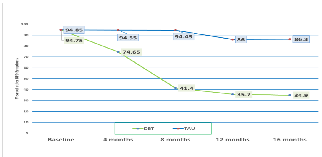
Fig. 1A. Comparison between the two studied groups regarding borderline symptoms as assessed by borderline symptom list (BSL) across periods during treatment year and at 4 months follow up

t p : Value for Student t-test **: Statistically significant at p \leq 0.01