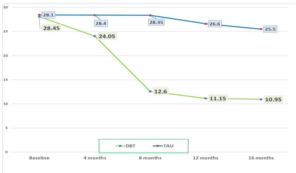
Fig. 1B. Comparison between the two studied groups regarding BPD behavior symptoms subscale as assessed by borderline symptom list (BSL) across periods during treatment year and at 4 months follow up