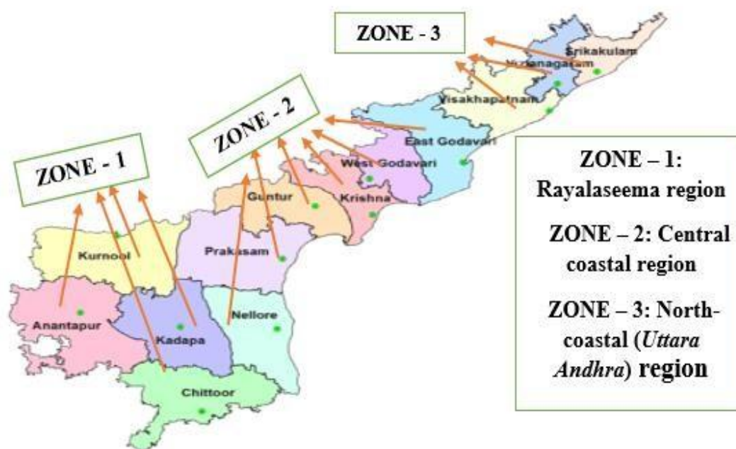
Fig. 2. Map of Andhra Pradesh showing the three administrative zones selected for the study

Out of the various consequences expressed by veterinarians with respect to sex-sorted semen technology, though there are desirable consequences like more female calves and improved genetic distribution which fulfills the need of improving milk production Bhalakiya et al. [2]; Cooke et al. [3], there is need to improve the skills and manpower to further facilitate the adoption of this technology Khanal et al. [4]; Kumar et al. [5]. This may also reduce the cost and improve fertility rate depicted from Table 2.