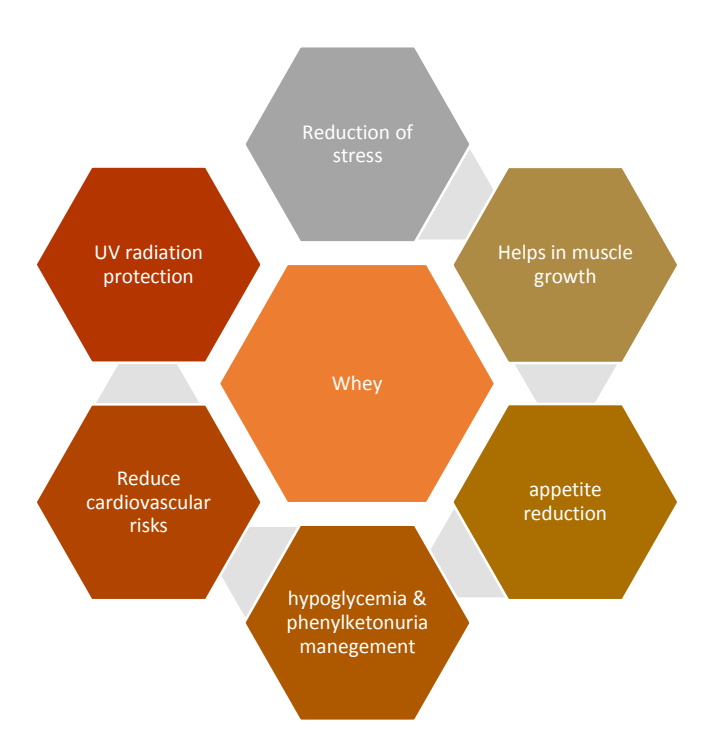
Fig. 2. Showing the health benefits of whey proteins in various forms