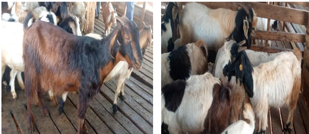
Fig. 2. Malya goats