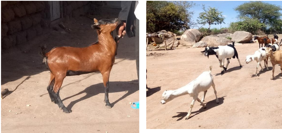
Fig. 3. Sukuma goats