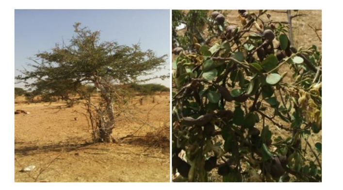
Fig. 1. B. rufescens in its natural environment

The leaves and stem bark of B. rufescens were harvested and dried at room temperature 30±2°C away from the sun and ground using a Moulinex brand Zaiba (Super Blender, China). The powder obtained was stored in a cardboard box at room temperature, in a dry place and protected from humidity and light until use. The obtained powders were used for the preparation of different aqueous (infusion, maceration and decoction) and hydroethanolic (95%, 75% and 50%) extracts following the methods